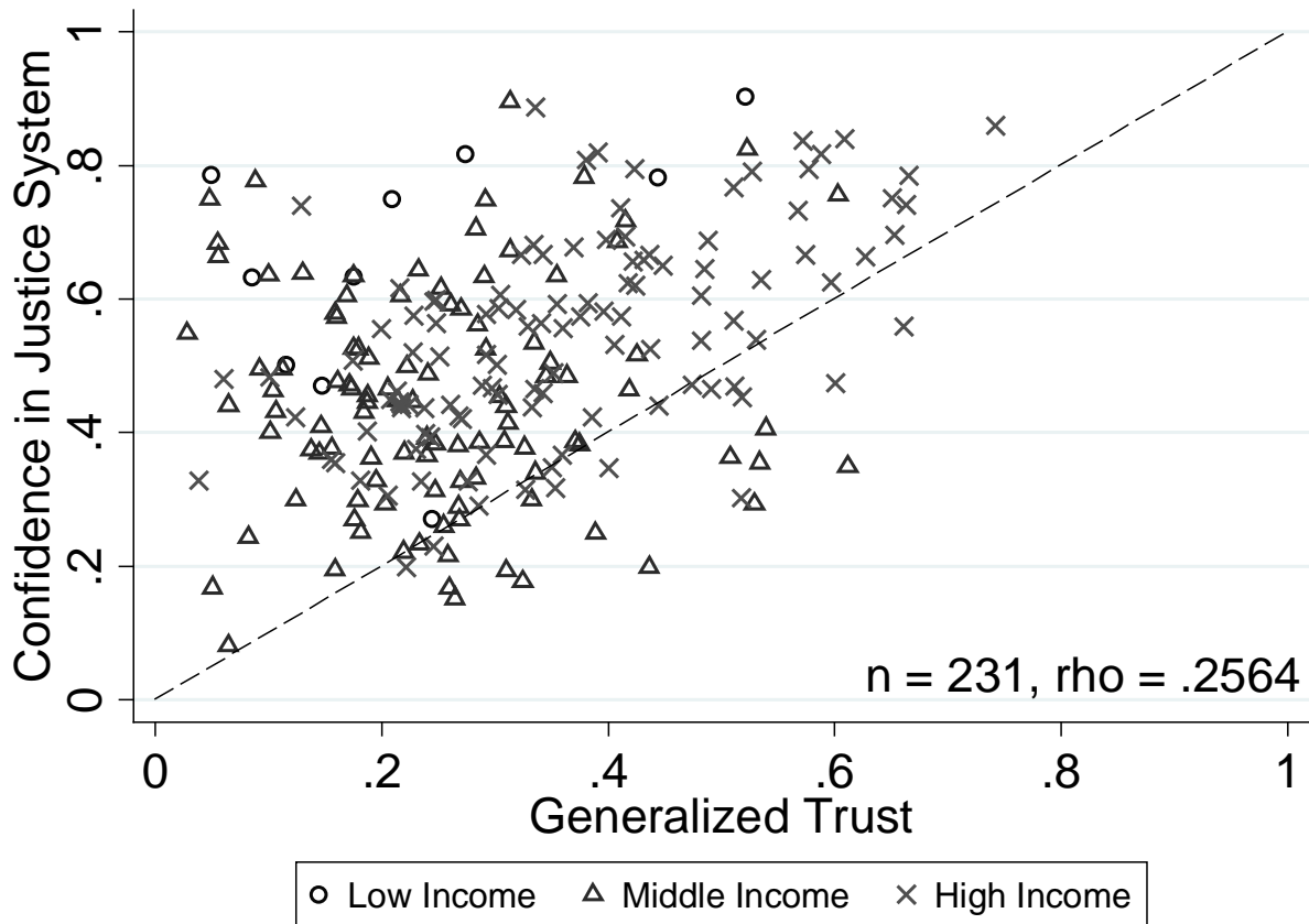
Figure 2. Correlation between Generalized Trust and Confidence in the Justice System a

a , The differentiation between Low-, Middle- and High-Income Countries follows the World Bank List of Economies (April 2010) Source: European and World Values Survey 1981-2009; Life in Transition Survey, 2006