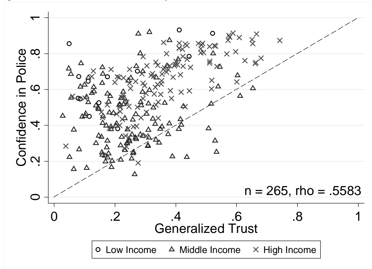
Figure 1. Correlation between Generalized Trust and Confidence in Police a