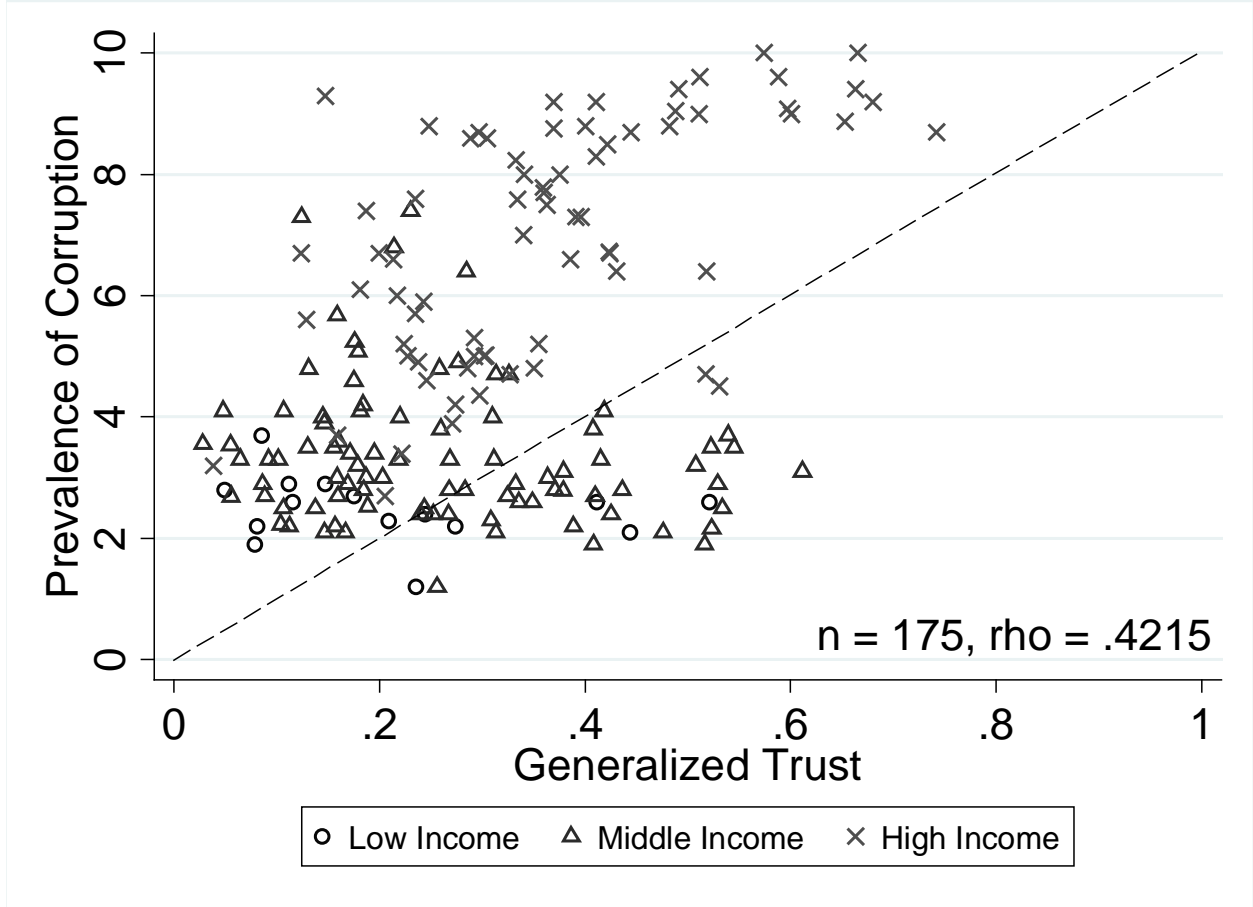
Figure 4. Correlation between Generalized Trust and the Perception of Prevalence of Political Corruption a