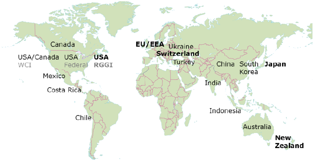
Figure 1: Implemented (bold) and planned GHG ETS

Despite its theoretical merits and its proven empirical capacity, ETS’ detrimental ecological, economic, and distributional effects have been heavily criticized by environmental and social movements as well as by the industry (Altwater/Brunnengraber 2008). While some critique is exaggerated, in many cases, at least up to now, climate policy ETS in practice are not based on ambitious sustainability criteria. Nevertheless, effective, efficient, and just climate protection is undoubtedly necessary, because unrestrained global climate change will inevitably cause unpredictable and irreversible damage to the ecosystems mankind depends on (IPCC 2007), it induces adaptation costs way beyond the costs of immediate climate protection (Stern 2007), and it inflicts unethical harm to present as well as future generations (WCED 1987). Thus, any climate policy has to be based on sustainability criteria in order