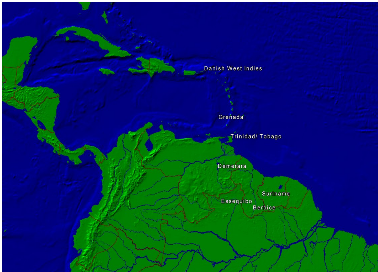
Map 1: Geographical Location of Plantations