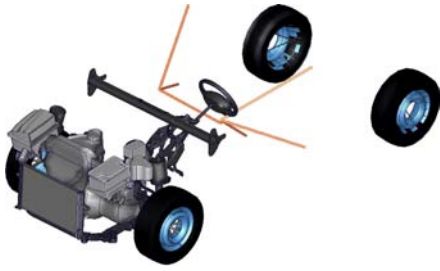
(a). Opel Astra 1998.