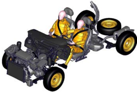
(b). Opel Astra 2003.