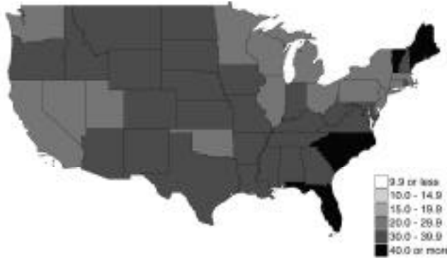
Figure 3 Percentage of Employed Heads of Household Earning around the Minimum Wage, 1940

Note: See table in note 2 for data by state (Hawaii and Alaska were not states in 1940). Source: Data from the IPUMS [Steven Ruggles and Matthew Sobek et al., Integrated Public Use Microdata Series: Version 2.0 (Minneapolis: Historical Census Projects, University of Minnesota, 1997)].