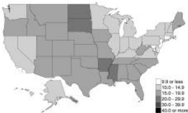
Figure 4 Percentage of Employed Heads of Household Earning around the Minimum Wage, 1990

Note: See table in note 2 for data by state. Source: Data from the IPUMS [Steven Ruggles and Matthew Sobek et al., Integrated Public Use Microdata Series: Version 2.0 (Minneapolis: Historical Census Projects, University of Minnesota, 1997)].