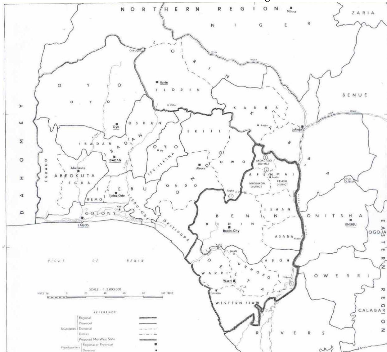
FIGURE 1. Colonial southwestern Nigeria