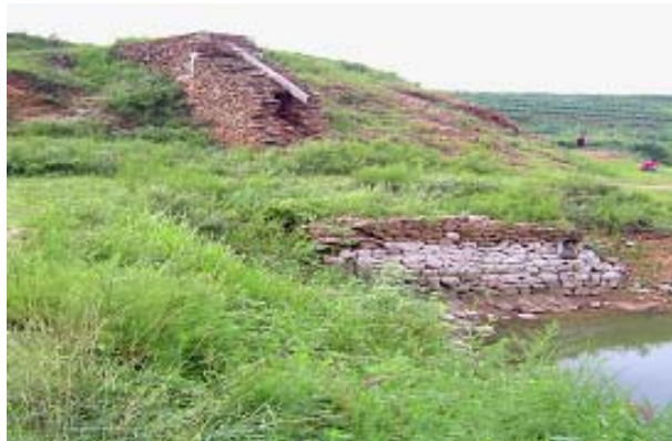
Figure 2. A Collapsed Irrigation System

To further understand the current situation of rural infrastructure, a few photographs taken by the authors can give readers a first impression of some Chinese villages. Figure 2 is an irrigation system that has collapsed and is poorly maintained. In Figure 3 we see garbage dumped along a riverside. Figure 4 shows dunghills placed alongside the roadside of a village. It is obvious that the current rural infrastructure and environments are worsening to some extent, and that rural infrastructure is not simply a problem of money, though money is important. Before economic reform and at the early stage of reform, rural households were even poorer than today, but the environment was better. Since the Chinese economy is growing at an annual rate of 9% and government revenue has doubled every five years since 1990, poor rural infrastructure should not be attributed to a lack of money. Behind these pictures lie an uneven distribution of income between rural and urban residents, government revenue allocations between the central and rural governments, poor rural collective management, and poor public awareness and daily habits regarding environment protection.