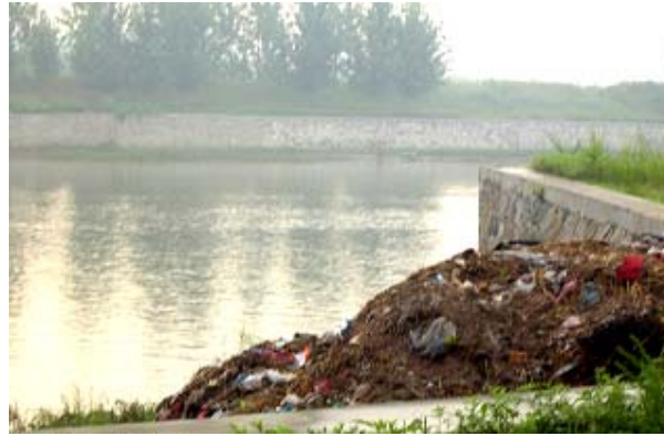
Figure 4. A Pile of Dung near a Village