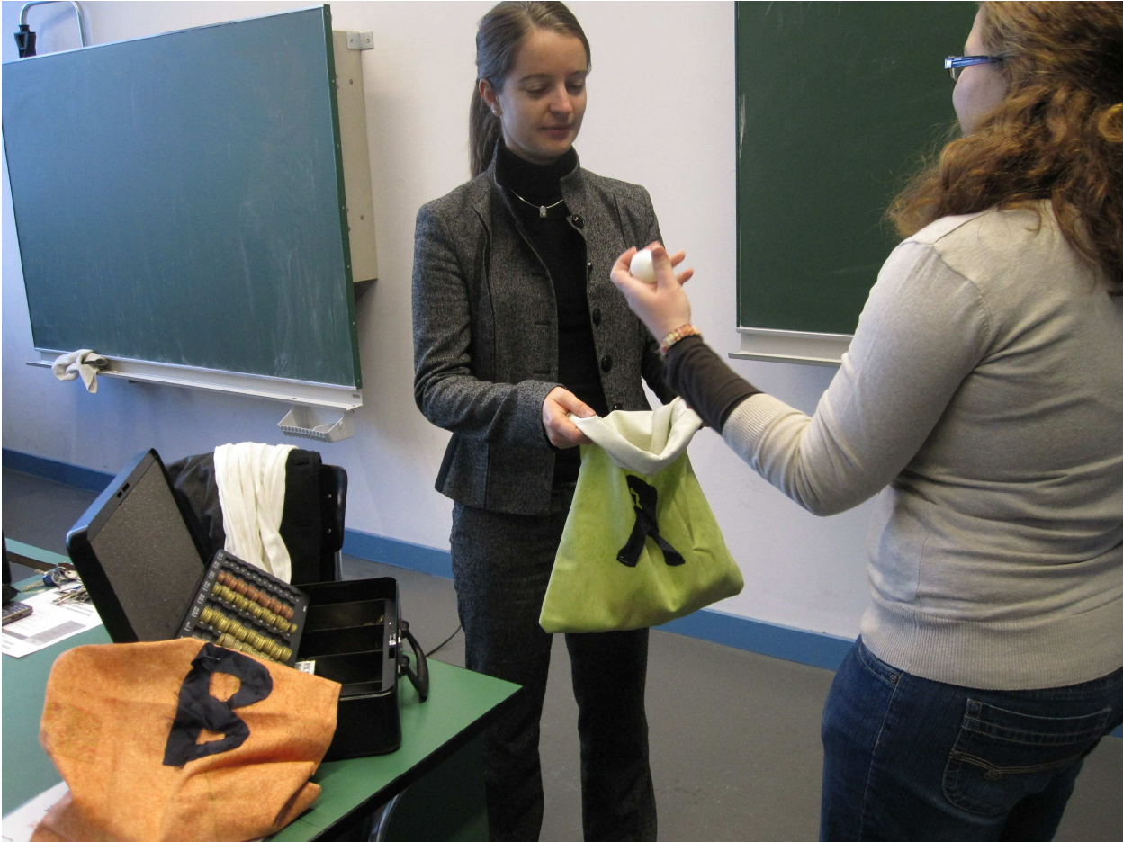
A photograph illustrating how participants drew from one of the bags (A or B)