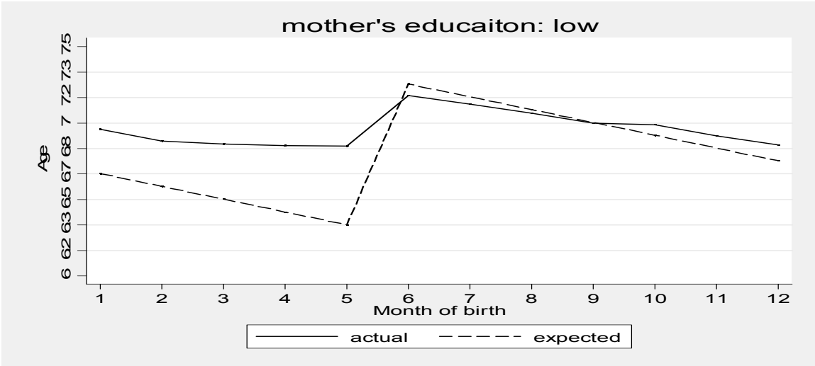
Figure A3 Average actual school starting age versus average expected school starting age, non-disadvantaged children, grade eight