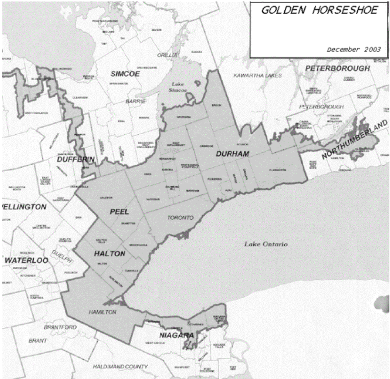
Figure 1. Map of the Golden Horseshoe, Ontario, Canada