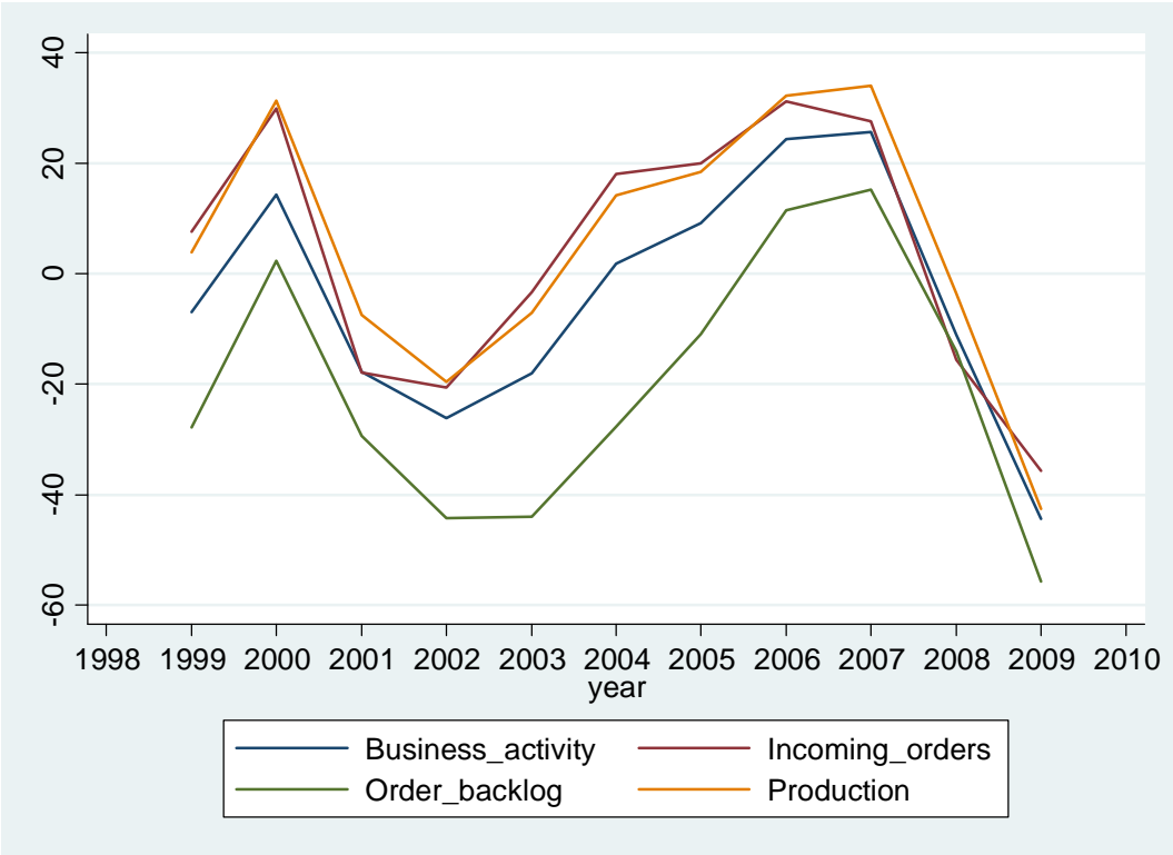
Figure 1: Business indicators 1999-2009