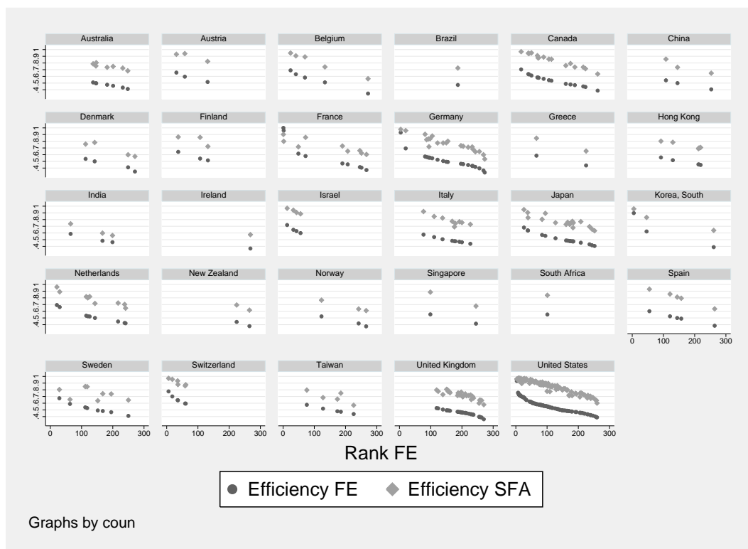
Figure 1: Distribution of efficiency scores across countries comparing FE and SFA

lower panel of table 4 confirms this visual impression by showing a Spearman rank correlation of nearly 0.9 between the FE and SFA model. The high correlation of these two approaches to identify efficiency supports the distributional assumption of the SFA .