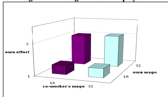
Figure 1: Average Effort - Employees 1

An immediately apparent feature of Figure 1 is that Employees 1 expend more effort when they are paid a high wage. In fact, employees' average effort when the own wage is high exceeds the effort exerted when the own wage is low by around 0.714 when the co-worker's wage is low, and by 0.750 when the co-worker's wage is high. Both differences are highly significant ( p < 0.001 in both cases). 8 This pattern reproduces the standard "reciprocity result" documented in the GEG literature: employees reciprocate higher wages with higher effort.