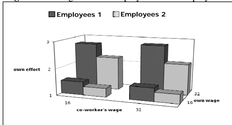
The figure shows average effort by non-selfish Employees 1 (n=16, dark bars) and non-selfish Employees 2 (n=16, light bars).

How much “reciprocal effort” does the Employer lose on average when effort comparison information is made available? Table 2 answers this question and reports the magnitude of Employee 1’s and Employee 2’s average reciprocal responses for the various co-worker’s wages and (where applicable) effort levels. Reciprocal responses are computed as the change in own effort after an own wage rise ceteris paribus , i.e. holding constant the co-worker’s wage and (for Employees 2) effort. 11