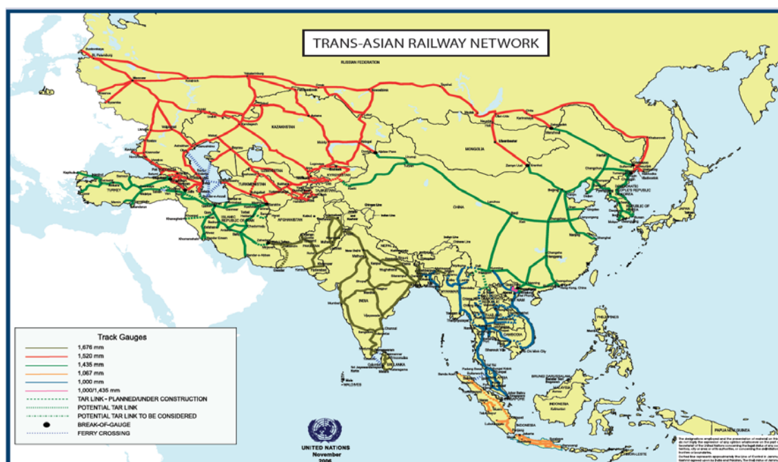
Figure 2: Trans-Asian Railway Network