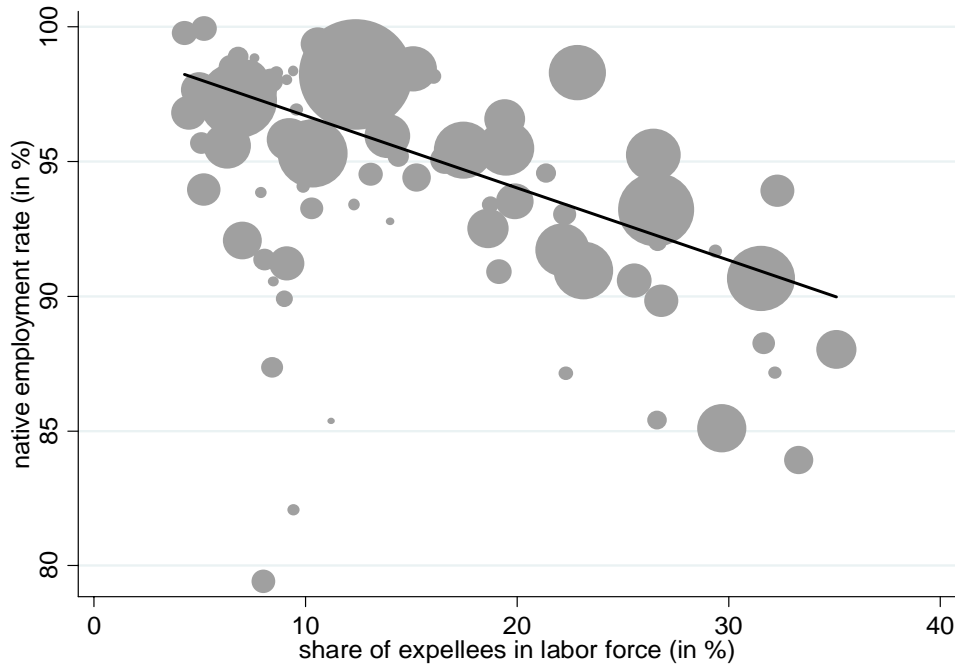
FIGURE 2: EXPELLEE INFLOWS AND NATIVE EMPLOYMENT, LINEAR FIT

Notes: Each point refers to a state-occupation cell. The size of each point indicates the size of the native male labor force in the cell. The regression line weighs the data by the native male labor force in each cell.