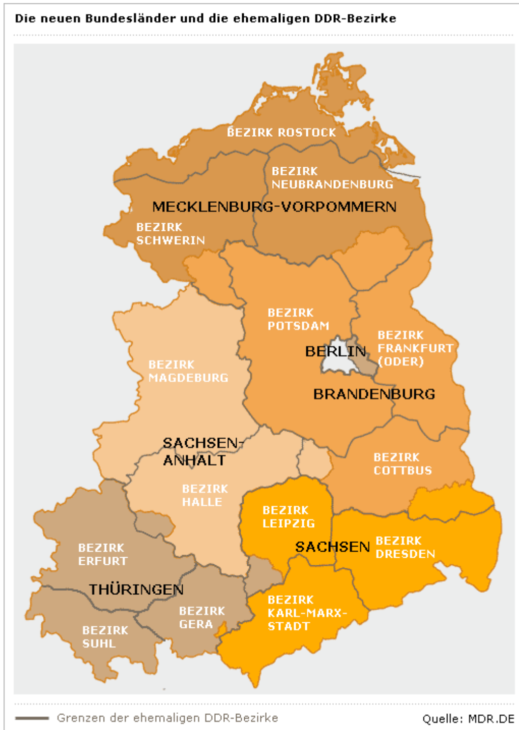
Map 1: Territorial Structure of the Federal States and the former Regional Districts in East Germany, 1990

parts of the former regional districts were merged with neighbouring federal states (Map 1). Similarly, the size of the new federal states do not coincide completely with the one of their predecessors operational between 1946/47-1952.