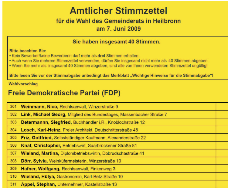
Figure 1: Ballot: Free Democratic Party, Heilbronn, local elections 2009.