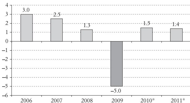
Table No. 1. Gross domestic product for Germany in the years 2006 to 2009 and forecasts for 2010 and 2011 in terms of change rates compared to the prior year.