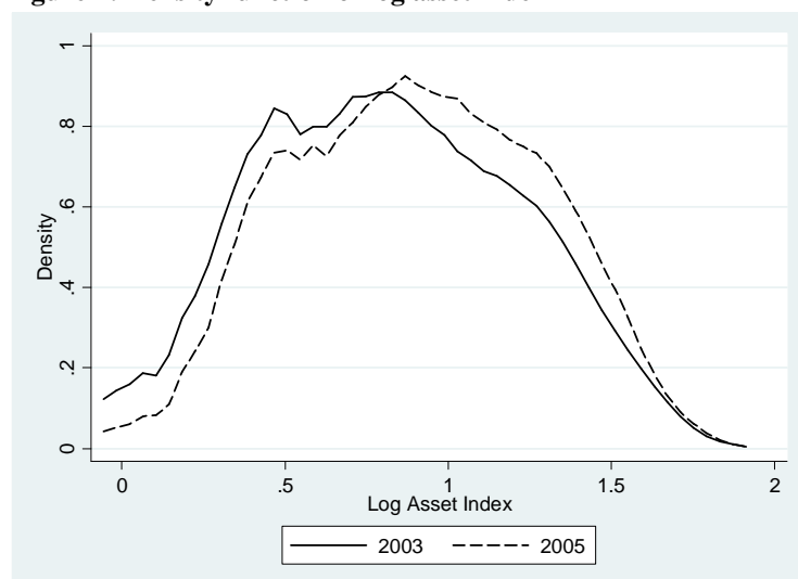
Figure 4: Density function of log asset index