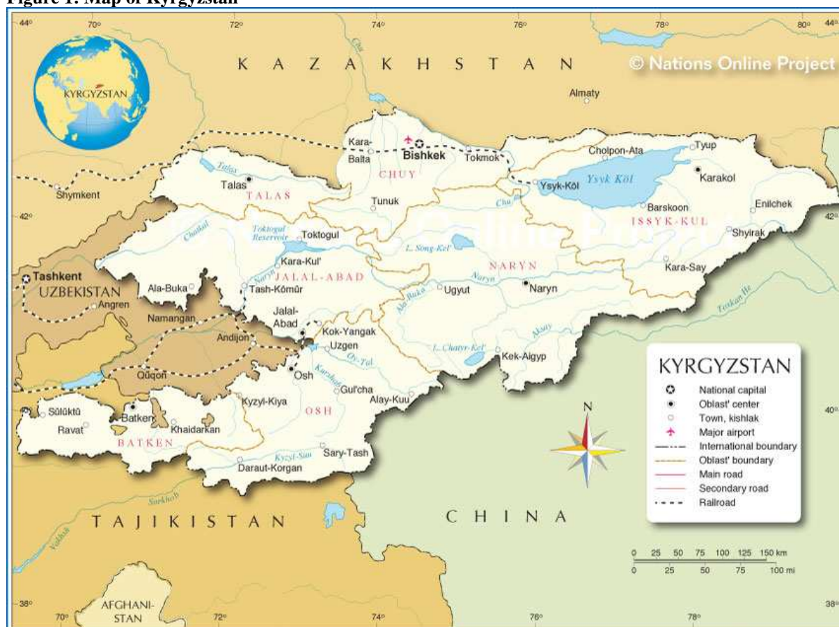
Figure 1: Map of Kyrgyzstan

Source: http://www.nationsonline.org/oneworld/map/kyrgyzstan-administrative-map.htm