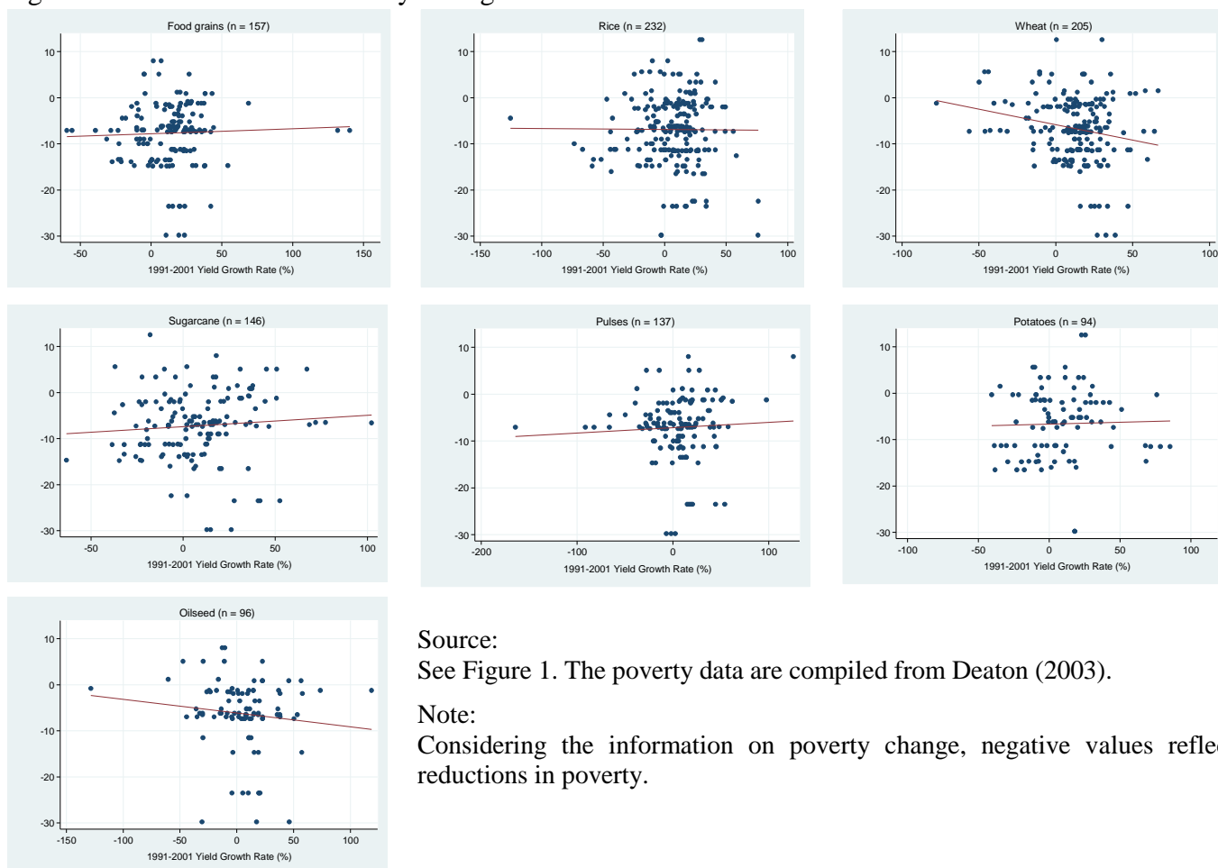
Figure 2: 1993/94-1999/00 Poverty Change vs. 1991-2001 Yield Growth Rate