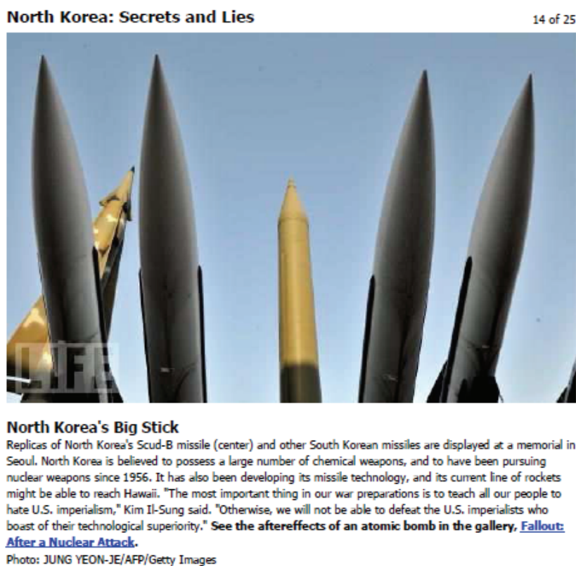
Fig. 6: The North Korean Missile Threat (LIFE [undated])

The footer of the image provides a link to another photo essay which allows viewers to “see the after-effects of an atomic bomb.” The juxtaposition of the consequences of a nuclear attack with North Korea’s aforementioned nuclear ambitions and missile capabilities is a direct articulation of its dangerousness. What is left out is that the United States is the only country to have used nuclear weapons.