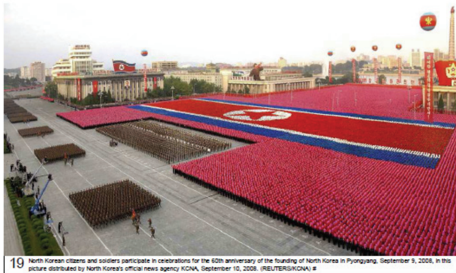
Fig. 5: A Homogeneous Mass (Boston Globe 2008)

While North Korea is represented as a threat, it is also construed as standing outside of, or defying, international obligations and norms. In this context, observers frequently cite missile and nuclear tests as well as withdrawals, non-ratifications, and non-compliance with international treaties, such as the Non-proliferation Treaty (NPT) and the Comprehensive Test Ban Treaty (CTBT), and with the UN Security Council's resolutions (CEU 2009). The image of North Korea as an outcast is frequently mirrored in the international press and the pictorial representations of North Korea.