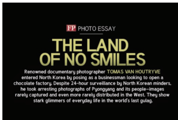
Figure 2: “The Land of No Smiles” (ibid.)

The observation of supposedly dismissive North Koreans made in the essay is not uncommon among many North Korea visitors. In his illustrated book entitled The Last Paradise , photojournalist Nicolas Righetti similarly noted,