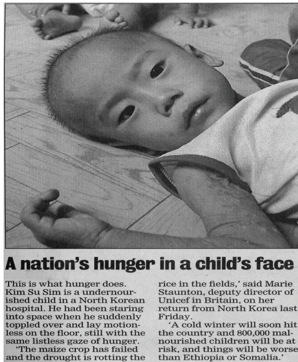
Figure 3: "A nation's hunger in a child's face" (Observer 1997)

Figure 3 shows a child lying on a floor in a North Korean hospital and carries the heading "A nation's hunger in a child's face". This picture epitomises a pars pro toto representation with the "motionless" and "listless" child embodying the "nation's hunger", that is, the suffering and plight of the people of the DPRK. The ailing boy serves as the synecdochic signifier for a vulnerable country and provides the reader with an interpretative frame, which allows for the reading of the image only in terms of a nationwide humanitarian emergency. Similar to the example above, the partial content (boy) assumes the legitimate representation of the whole (nation), thereby revealing the hegemonic mode of the image. The photograph—together with its captions—purports to offer a summary of the nutritional conditions in the country, suggesting that North Korea's reality is proceeding in the same way as the boy's. The part (boy) becomes constitutive of the whole (the nation's reality) or, as Chandler has noted, "[t]hat which is seen as forming part of a larger whole to which it refers is connected existentially to what is signified—as an integral part of its being" (Chandler 2007).