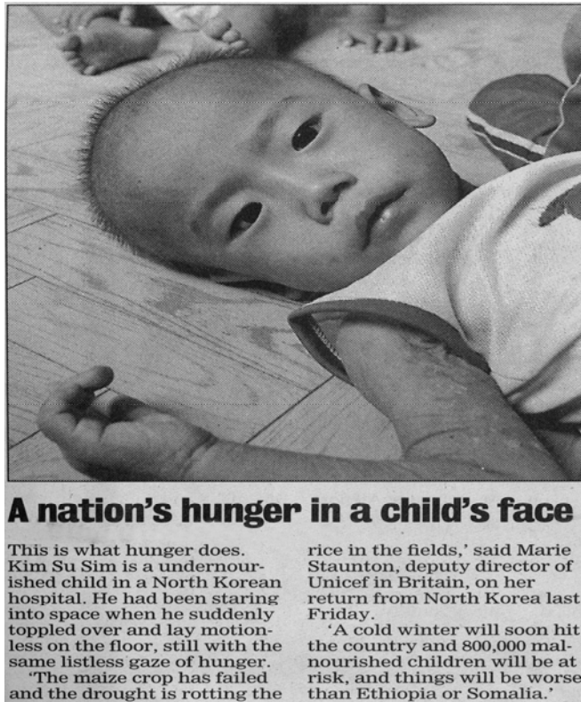
Figure 1: A Nation's Hunger in a Child's Face