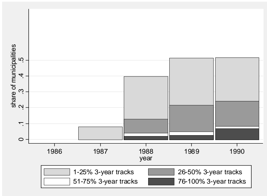
Figure 1 Share of municipalities that participated in the pilot scheme each year, and the extent of their participation

Notes: ‘% 3-year tracks’ is the percent of all vocational tracks available in a municipality which were part of the pilot scheme.