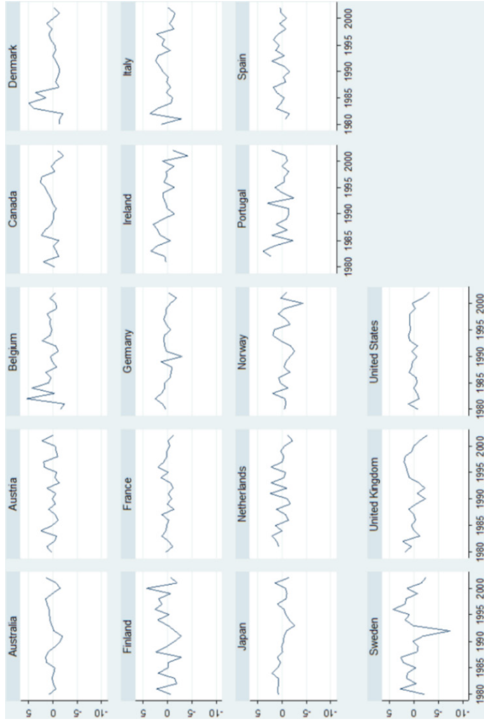
Figure 2 Difference in cyclical adjusted primary balance