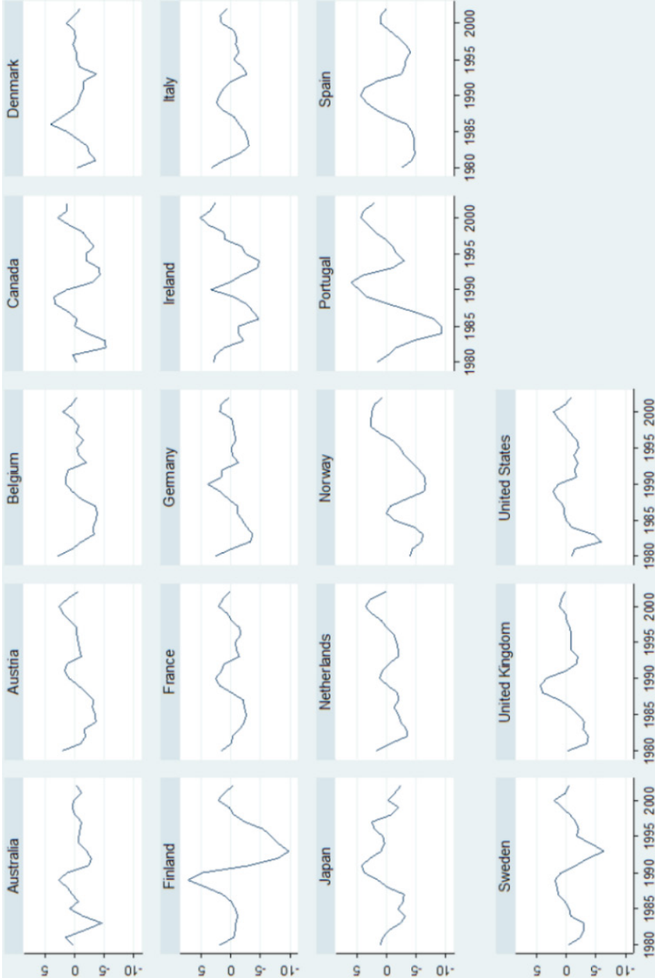
Figure 3 Output gap of the total economy