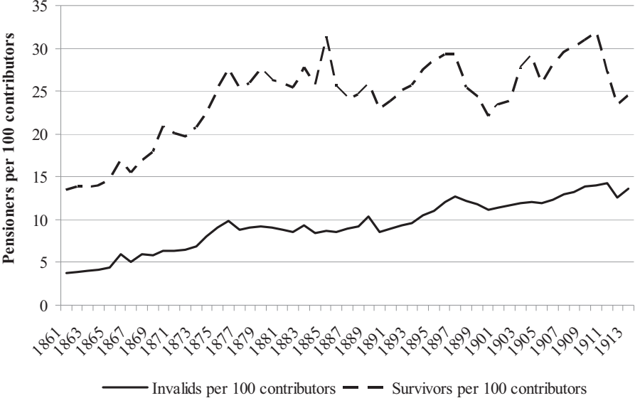
Figure 1. Average number of invalids and survivors per 100 contributors per Knappschaft .

This paper aims to contribute to the literature on the weakness (alleged, perhaps) of modern PAYGO social security systems in financing pensions by taking a business and economic historical perspective on the issue. This undertaking has potential since the PAYGO pension insurance system has a quite long tradition, at least in Germany. Knappschaften (singular Knappschaft ), the mutual insurance funds of German miners, provide the historical context for this paper. 1 In particular, I focus on the business history of all 103 Prussian Knappschaften , the most important, and comparatively best-documented funds. The study period covers the years 1854 to 1913, the formative period of the German welfare state. Because it was in 1854 that the miners' Knappschaften took on the character of insurance funds thanks to liberal Prussian mining reform, this year seems to be a natural starting point. The beginning of the First World War seems to be a natural end point for this study.