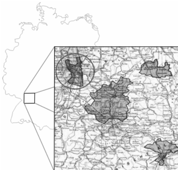
Figure 1. Spatial distribution of the common hamster in Baden-Württemberg in 1936 (grey areas) and 1995 (circled).

The Western-most populations of the common hamster are in Belgium, The Netherlands, and France, where the hamster has suffered severe population breakdowns and genetic impoverishment (Neumann et al., 2004). The German hamster populations are important contributors to the stock of common hamsters in Western Europe, because of their role as bridges to hamster populations in Eastern Europe and Asia (Neumann et al., 2005). In Germany, the regions that contain populations of the common hamster are Baden-Württemberg, Bavaria, Lower Saxony, Hesse, North Rhine-Westphalia and Saxony-Anhalt. Protection of the common hamster is now a serious consideration in spatial planning in these regions.