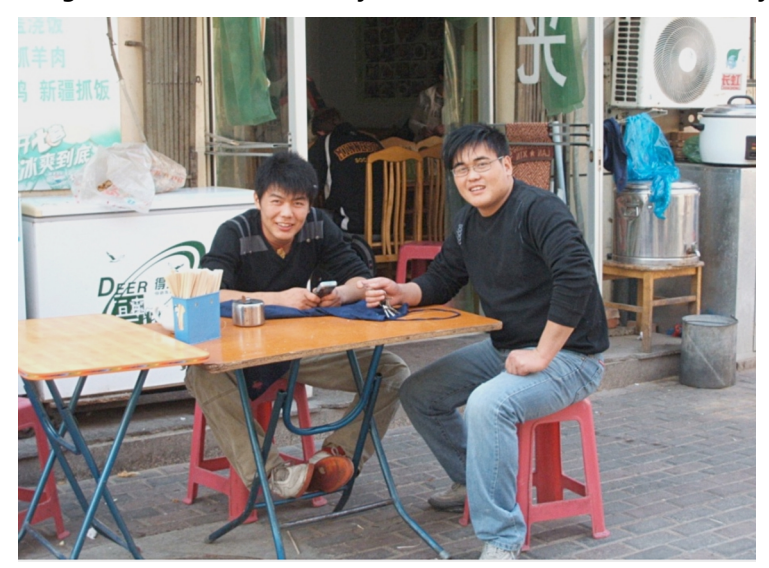
Image 2: Narrators of the story: the male cousins of the Ma family (Nov. 2008)