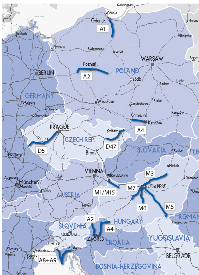
Figure 3. Map of initiated highway PPP/concession projects in Central and Eastern Europe

At the beginning of transition, the highway systems of CEE countries were underdeveloped, and there were practically no cross-country highway links.