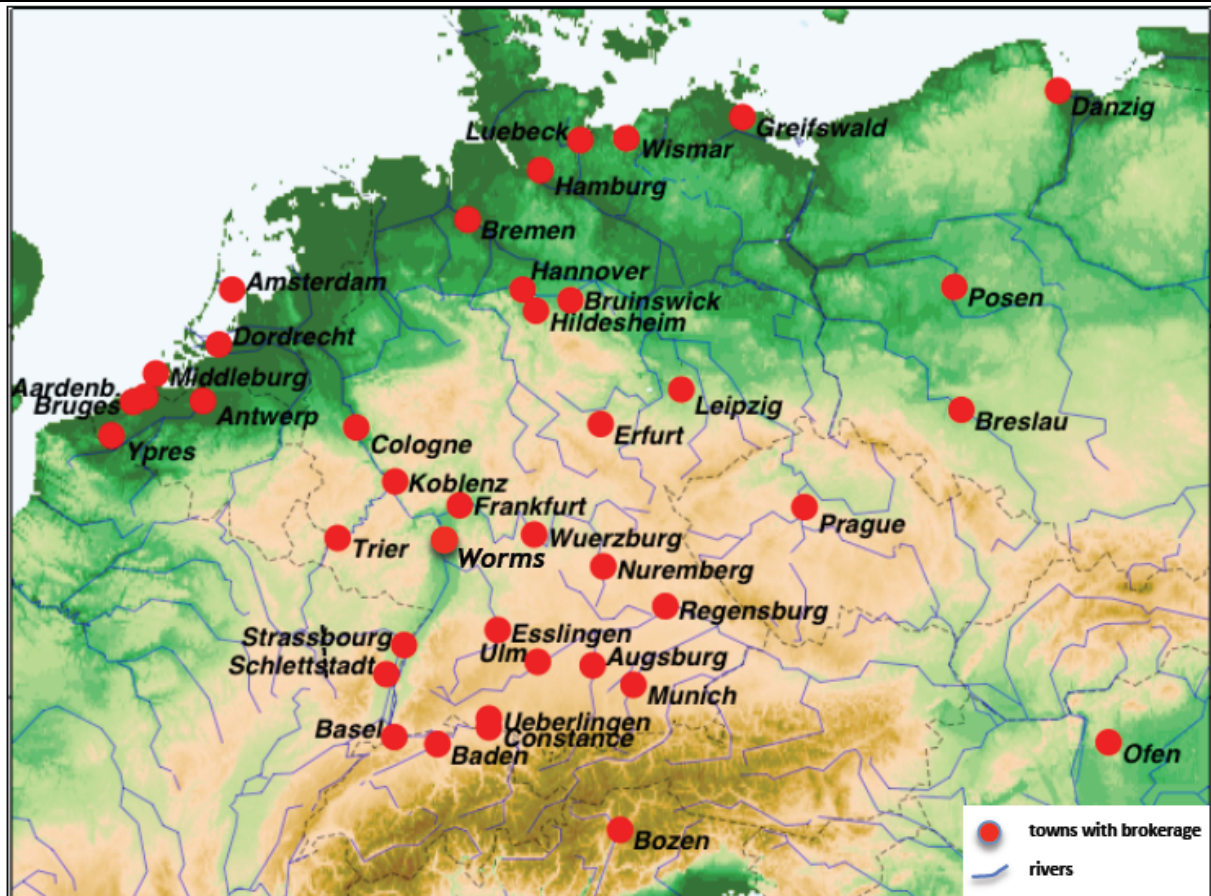
Figure 1 – Towns with Brokerage Regulations

Note: We also found brokerage regulations for Nowgorod, but we restricted the map to the core area under study in order to increase clarity.