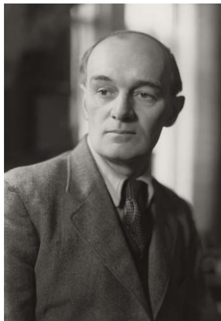
Thomas Humphrey Marshall (1893-1981)

tional Service' of the BBC. 6 One such series in 1938, which lasted over eleven weeks, was devoted to a national debate on 'Class and Social Distinctions'. As contributors to these programmes, Marshall recruited high-flying performers from Oxford, Cambridge, and London University: among them Harold Laski, Lionel Robbins, Michael Postan, Eileen Power, Barbara Wootton, Julian Huxley and many others. His role in chairing and summing-up these debates, which he did with great charm and panache, was admirably suited to his synthesising, birds'-eye-view, style of intelligence; and the celebrity he acquired from his BBC role (rather than his repute as a scholar) may well have lain behind the eventual invitation to give the Alfred Marshall lectures in Cambridge in 1949. Further distractions came with the outbreak of the