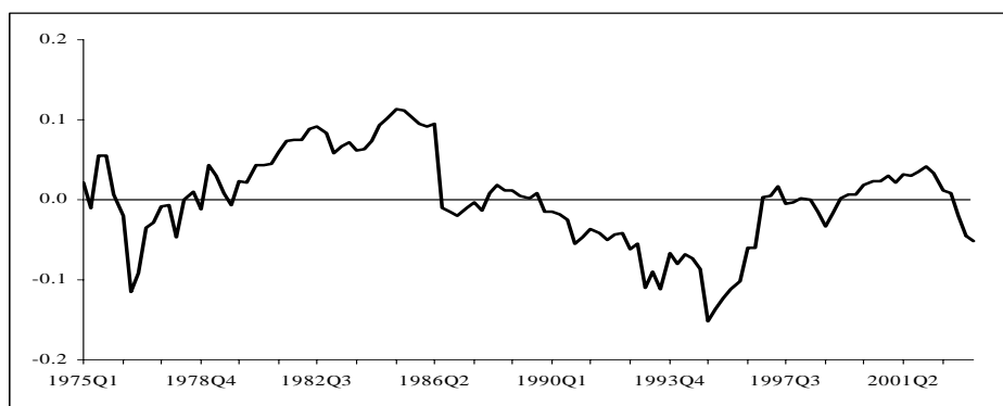
Figure 2: IRELAND/GERMANY: actual minus fitted.