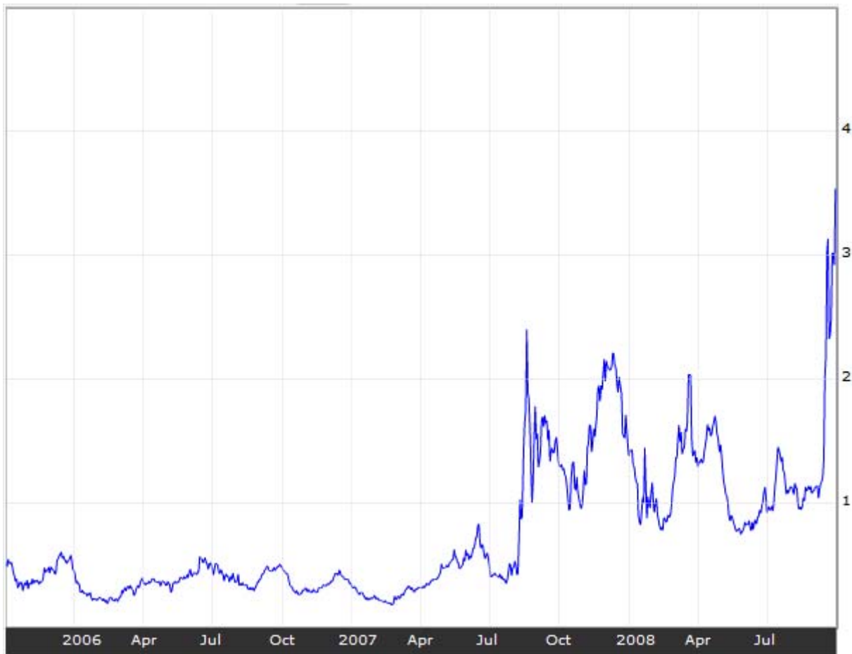
Figure 1: Spread between 3-month LIBOR and 3-month Treasury bills (TED spread, in percent) over the last 36 months (3Q 2005 – 3Q 2008), Source: Bloomberg

And then there is the indirect channel of contagion, following from the dramatic rise in CDS spreads and lending rates in the interbank market where lending rates reached record levels for an extended period, and markets became shallow. For some institutions, like Bear Stearns and Northern Rock in March 2008 and Lehman Brothers in September 2008, interbank lending became virtually impossible, experiencing a run on its reserves 1 at the same time. While Northern Rock was bailed out and Bear Stearns was taken over by JP Morgan Chase subsidized by the government, Lehman Brothers went bankrupt. This indirect channel mainly affected institutions with strong reliance on interbank lending, investment banks in particular. Extremely high levels of LIBOR over risk-free rates (see Figure 1) and an unprecedented small supply of funds in the interbank market forced banks to boost their liquidity reserves. The write-downs of their asset portfolios diminished the banks' equity capital and forced them to raise capital from investors, including Sovereign Wealth Funds.