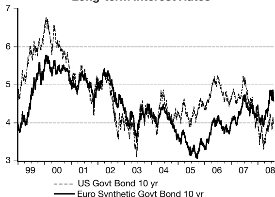
Figure 2 Long-term Interest Rates

Note: Daily data, in percentages.