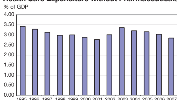
Figure 1 Health Care Expenditure without Pharmaceuticals

2002 and 2003 was the result of an average 50% increase in the salary of public employees, which was one of the election promises of the MSZP in the 2002 general election, and which later became one of the sources of the extremely high budget deficit in 2006.