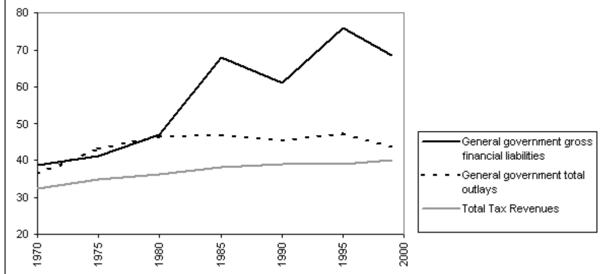
Figure 1: Total Tax Revenues, government spending, and gross public debt as a percentage of GDP (OECD-16)

Are changes in the composition of the tax burden more in line with conventional wisdom? Figure 2 presents the revenues of various types of taxes as percentages of the total tax revenue (tax ratios) and shows how these percentages have changed in the average OECD-16 country since 1965. Interestingly, the most obvious changes occurred before 1975, when national borders were still fairly closed. After the mid-1970s, tax ratios changed remarkably little. The changes that did occur make little sense in terms of the conventional wisdom. Revenue from taxes on property and consumption has decreased rather than increased since the mid-1970s. Corporate tax revenues have gone up rather than down. Only the rising percentage of social security contributions suggests that the tax burden on immobile tax bases - wage earners - has increased.[3]