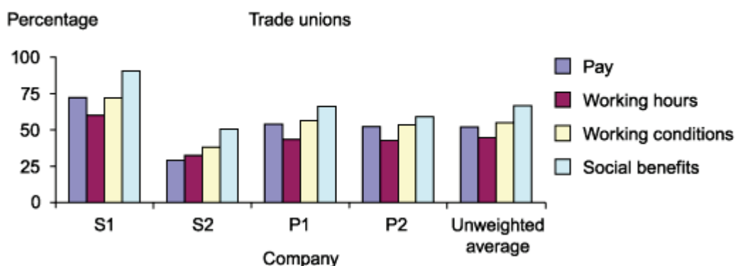
Figure 3 Percentage of respondents considering that trade unions have a high influence on selected terms and conditions of employment

Figure 3 indicates that on average, more than 50% of respondents consider that trade unions have a high influence on specific terms and conditions of employment. Their highest impact is on social benefits, followed closely by working conditions and pay. It appears that the influence of trade unions on pay increased, but in line with Vickerstaff/Thirkell's (2000) findings, the case studies evidence revealed that despite changes in the companies' environment, both private companies and SOEs still have a social role.