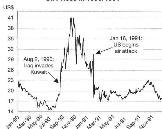
Figure 3 Oil Prices in 1990/1991 1

1 Brent spot price fob per barrel, daily figures.