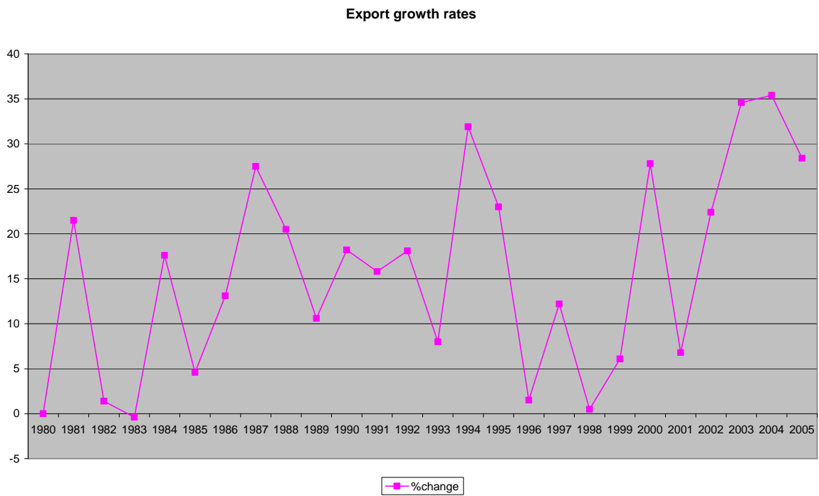
Figure 1: China's export growth rates