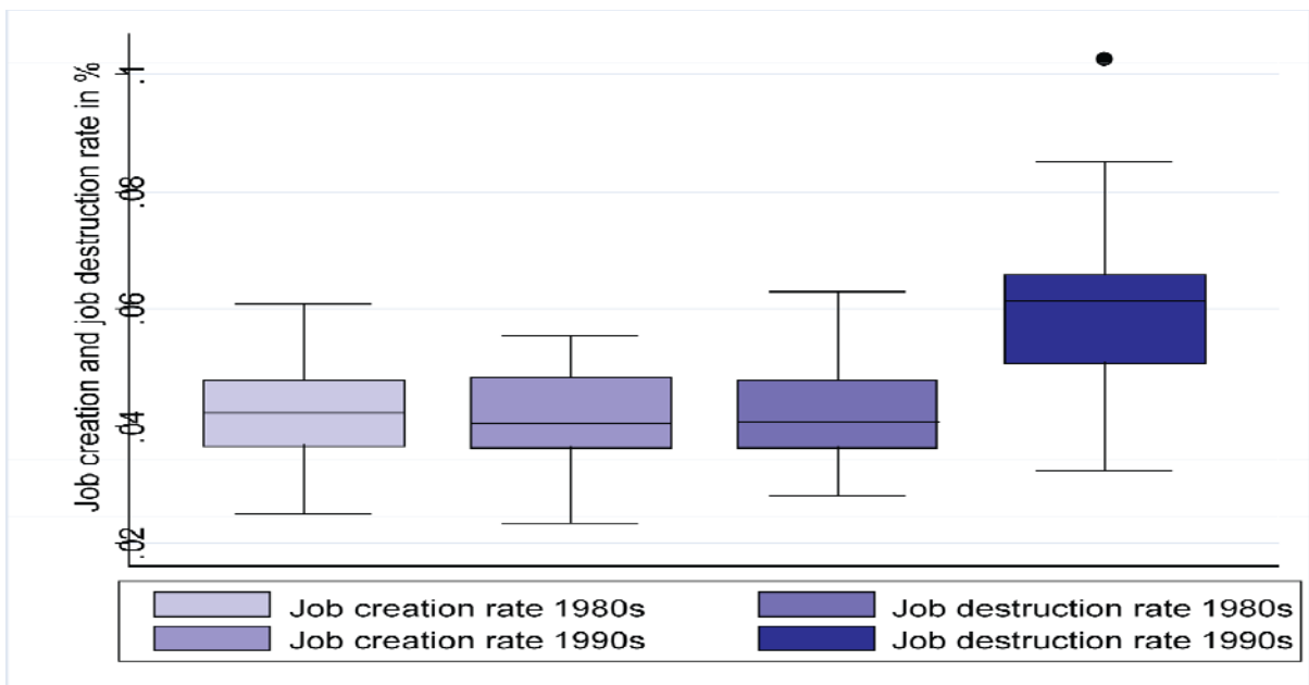
Figure 1: Distribution of average regional job creation and job destruction rates in forty-four counties of Baden-Wuerttemberg in the 1980s and the 1990s

Looking behind the aggregate net development of manufacturing employment illustrates that average regional gross job creation rates remained rather stable from the 1980s to the 1990s; the median is 4.2 in both periods. The decline in regional net employment growth from the 1980s to the 1990s has therefore been caused by a large increase in regional job destruction rates: While in the 1980s the median regional job destruction rate has been 4.0%, it rose to 6.1% in the 1990s (see Figure 1).