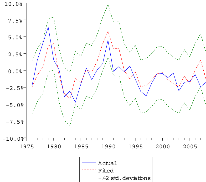
Figure 3: New houses: actual vs. fitted real house price changes (implicitly estimated coefficients).