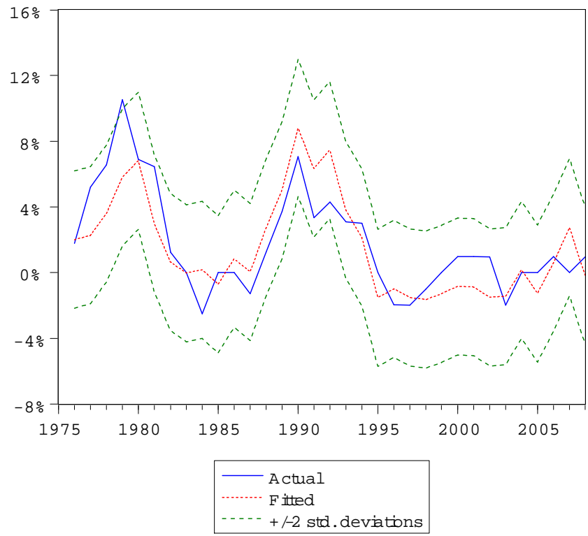
Figure 1: New houses: actual vs. fitted nominal house price changes (implicitly estimated coefficients).