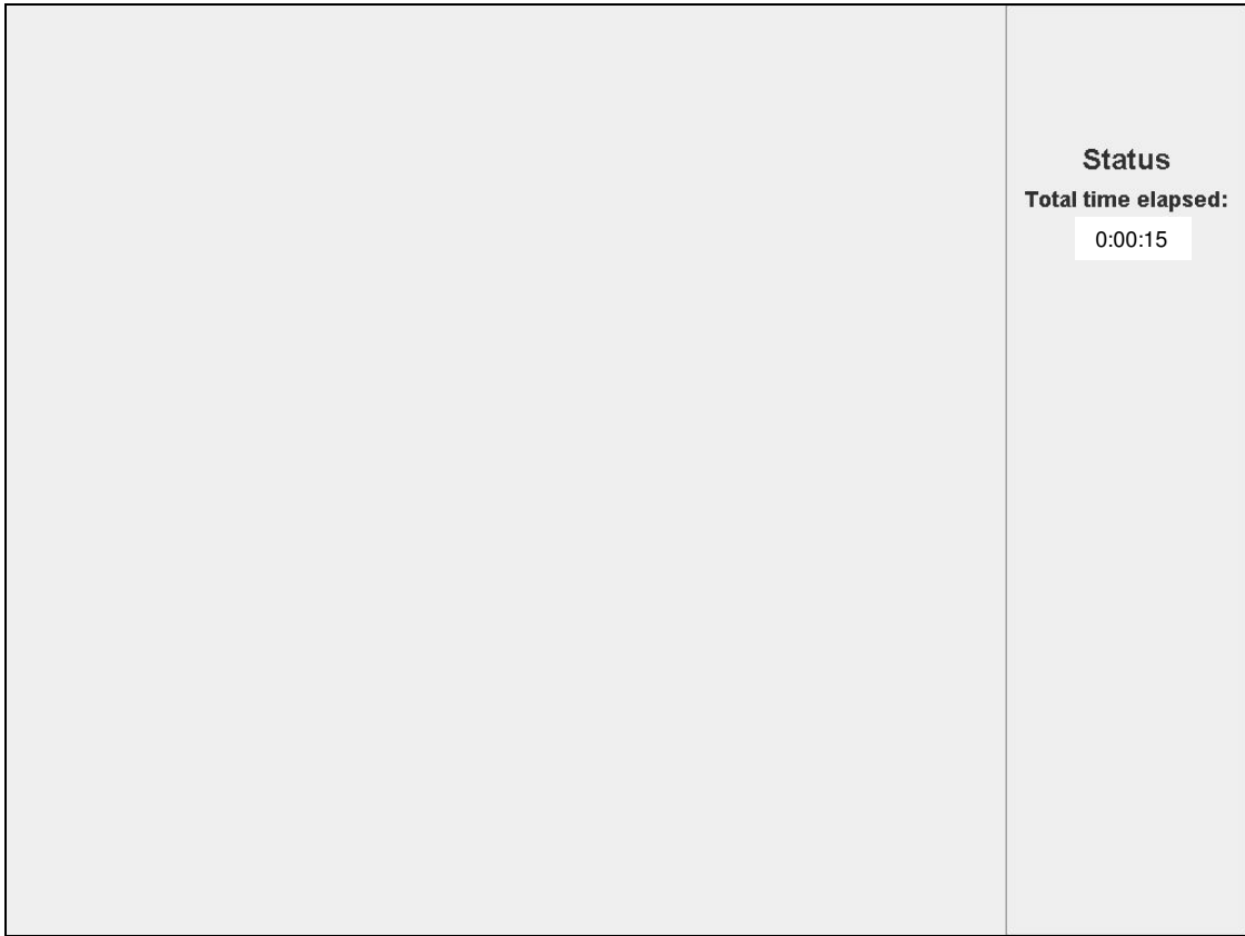
Figure A.2: Empty screen