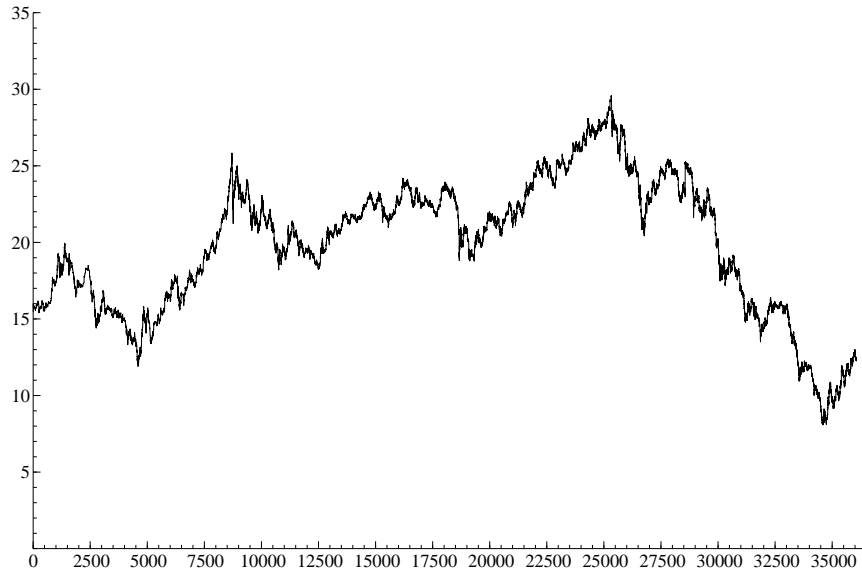
Figure 1: Equidistant 10-minutes EUA prices of the EUA futures contracts maturing in December 2008 (from 01/11/2006 to 15/12/2008) and in December 2009 (from 16/12/2009 to 18/03/2009). In total there are K \times T = 60 \times 601 = 36060 observations at the 10-minutes frequency.