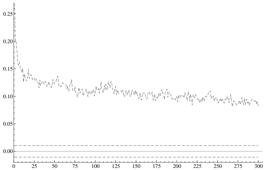
Figure 4: Autocorrelation function of filtered 10-minutes absolute EUA returns for five consecutive trading days. Dashed lines are 95% confidence bands.