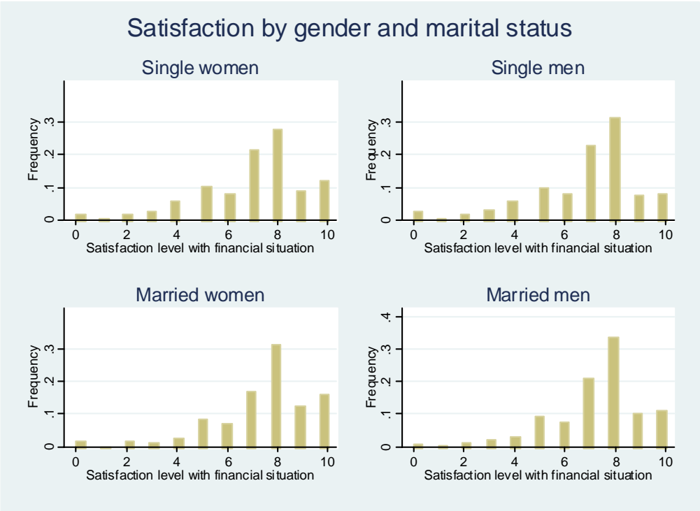
Figure 1: Frequencies of reported levels of satisfaction with financial situation