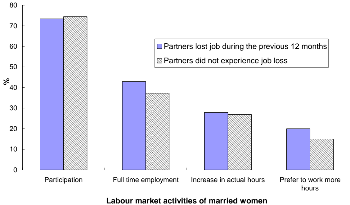
Figure 2. Females' labour market activities by partners' recent job loss experiences

Source: Authors' calculation using HILDA, waves 1-7, see text.