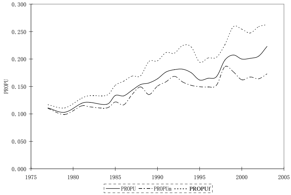
Figure 1 Proportion (PROPU) of University Participation by Gender