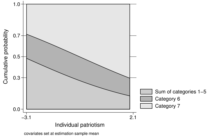
Figure 2: Probabilities of tax compliance

The figure uses the ordered probit results (see Table 4) to depict the probability of belonging to the seven tax compliance categories conditional on individual's patriotism. Categories 1-5 are collapsed to a single category because only a small fraction of individuals report tax compliance levels below four. The lower line represents the probability of reporting this collapsed category, while the upper line shows the cumulative probability of category six.