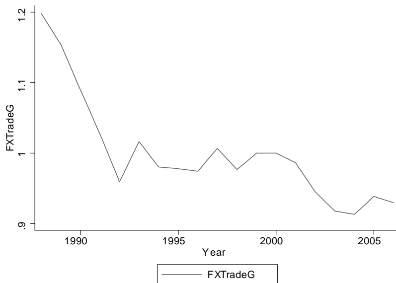
Figure 2: Real effective exchange rate

tries. Alexandre, Bação, Cerejeira and Portela (2009) provide a detailed description of the computations for a set of alternative effective exchange rates indexes for the Portuguese economy in the period 1988-2006. The results in that paper suggest that the choice of bilateral weights does not make much difference. The set of countries included in exchange rate indexes originates more variation but produces similar trends. A more important issue is whether to use aggregate or sector-specific exchange rates.