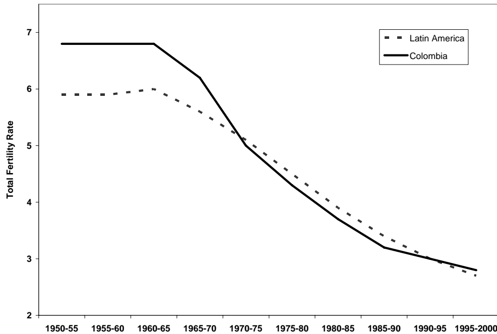
Figure 2. Total Fertility Rates in Latin America and Colombia between 1950-55 and 1995-2000

Source: "Latin America: Fertility 1950-2050", Demographic Bulletin No. 68, 2001, Economic Commission for Latin America and the Caribbean, The United Nations