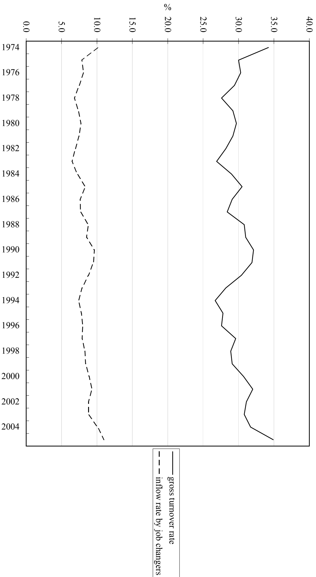
Figure 2: Labor Turnover Rate in Japan (1974-2005)

Source: Employment Trend Survey each year