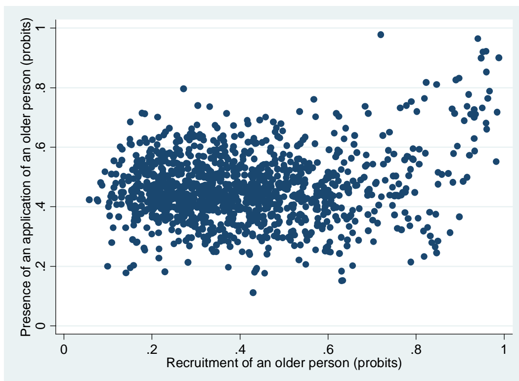
Figure 4.2: Estimated probabilities (probits) for the presence of an application from older persons and the recruitment chances of older persons

Source: IAB establishment panel 2004, own calculations